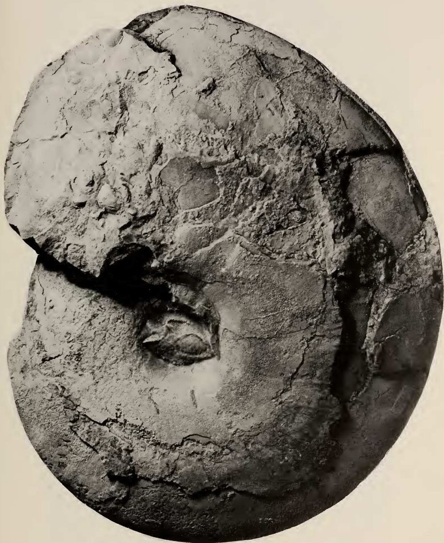
Fig. 2. Hatchericeras patagonense Stanton, 1901. OUM KX 1804. \times 0,6 .